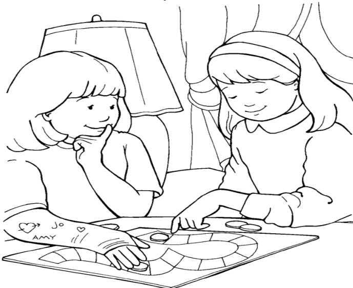
Showing Kindness Toward Others