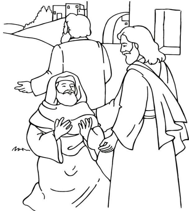
Jesus Heals the Leper

During the time when Jesus lived upon the earth, leprosy was very wide-spread and was a dreaded disease. When someone had leprosy, they were covered with sores all over their bodies. Unlike chicken pox, these sores didn't just go away. When someone had leprosy, it was hopeless, because there was no cure. To make matters worse, other people considered them to be unclean and were not allowed to touch them. Many people believed that people who had leprosy got the disease because of some terrible sin they had committed.